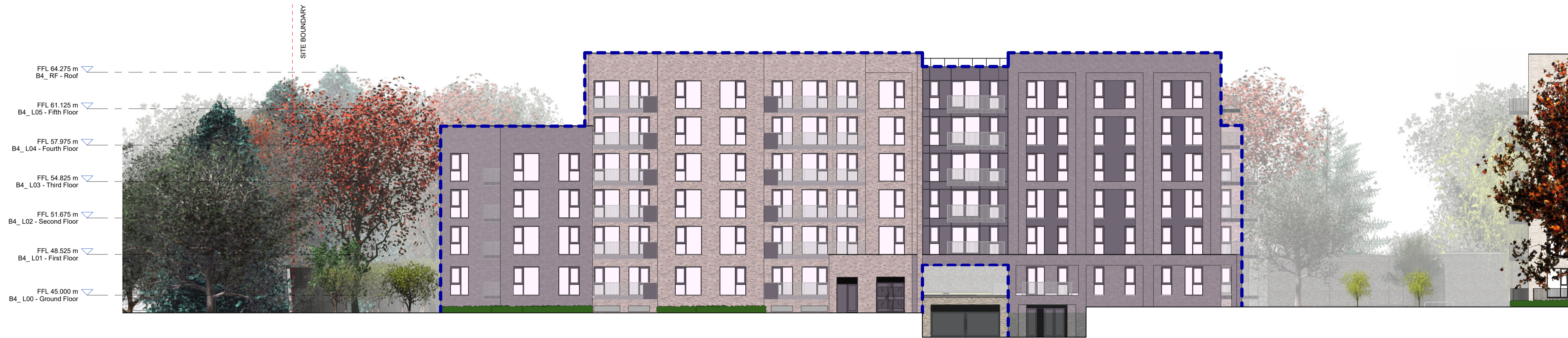
Block 04, North Elevation - Part V 1 : 200