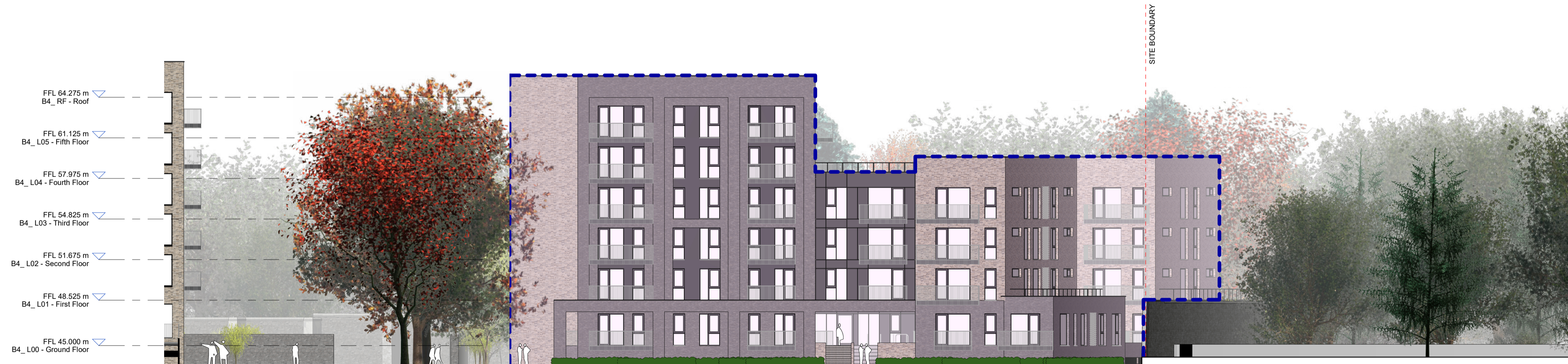
Block 04, West Elevation - Part V 1 : 200

Notes: - Do not scale from this drawing. Use figured dimensions in all cases. - Verify dimensions on site and report any discrepancies to the Architect immediately. - This drawing is to be read in conjunction with the Architect's Specification. - © This drawing is copyright and may only be reproduced with the Architect's permission.